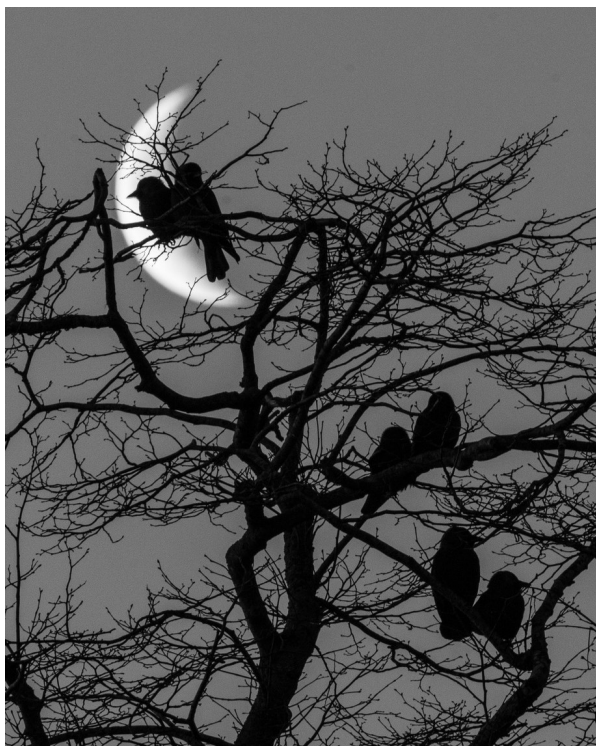
'By the Light of the Silvery Moon' the Jackdaws are paired up for spring all around Blisworth.

https://www.northamptonmuseums.com/info/6/visit/8/abington-park-museum